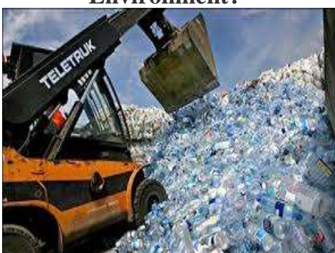
Over 3.5 Million Tons of Plastic That Do NOT Degrade!

What about the impact on the Environment?